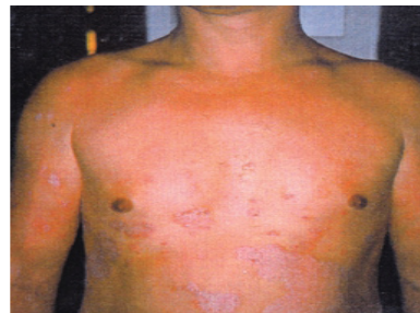
BEFORE USING D-LENOLATE

YES, our Topical product dries, heals and protects the skin. Our product, d-Lenolate helps your immune system attack the problem from within. Although scientists have not yet identified the exact cause or causes of psoriasis, they do know that psoriasis begins in the body as a fungi. d-Lenolate is an herbal supplement that helps improve and maintain the immune system. Psoriasis occurs when your immune system (the natural protection against bacteria, viruses, fungus, yeast) does not work properly and starts changing the behavior of your skin. Scientists believe that